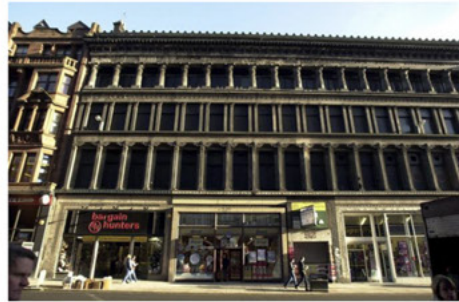
Much of the Egyptian Halls has been empty for 40 years